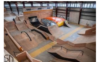
Air Rec Center Indoor Bike & Skatepark