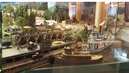
Miniature Railway at the Maple Ridge Museum