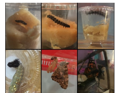
Painted Lady Caterpillar & Butterfly