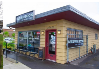
Bean Around Books Coffee Shop & Bookstore