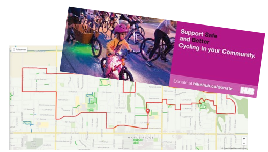
Find HUB Cycling Routes on the map at www.mrearthday.ca