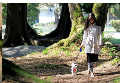
Westview Off-Leash Dog Park