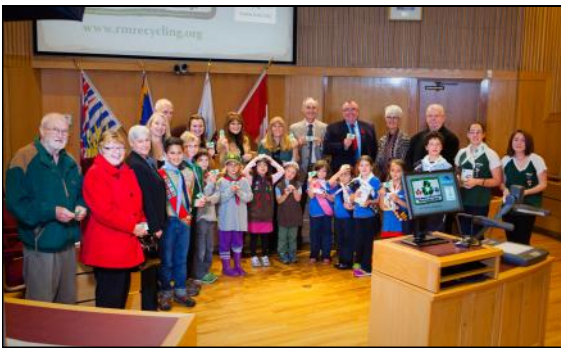
Maple Ridge Mayor & Council, local Guide & Scout Groups, & RMRS Board Members at the Waste Reduction Challenge Badge Presentation

Local Guide & Scout groups have been having a great time earning our Waste Reduction Challenge badge. It was wonderful to see their enthusiasm at our presentation to Maple Ridge Mayor & Council on Tuesday, October 28.