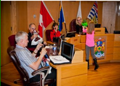
Zero Waste Kits included bags made from recycled street banners and potted snake plants, which NASA lists as air-purifiers

A number of initiatives are being tested out at Alouette & Fairview Elementary schools and will be a first step toward helping other schools in the District reduce waste, conserve water & energy, encourage reuse, and save money. These initiatives include a "Pack it in, Pack it out" policy, turning excess lights off in classrooms to save energy, placing 1-litre bottles in toilet tanks to conserve water, encouraging reuse through a used book exchange box in the school lobby, and adding special plants to classrooms to encourage nature appreciation and improve the air quality.