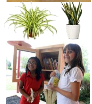
Little, free library!