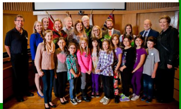
Maple Ridge Mayor & Council join Alouette elementary students & teachers and RMRS Board Members & Staff for a photo to celebrate Waste Reduction Week 2015