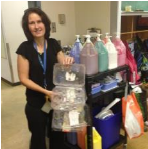
Start an “Art Cart” at YOUR school!