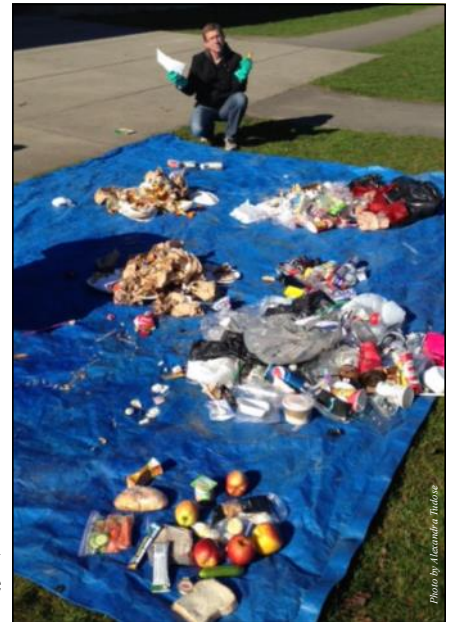
RMRS Environmental Educator Dan Mikolay shows the results of a recent waste audit at Maple Ridge Secondary School

The TWO items he's holding up are the only things they found that actually belong in the garbage. Think of the savings if that much were diverted every day, at every school, in every district. Money saved from garbage disposal fees can instead be used to fund organics & recycling programs. Could you do this kind of money-saving waste diversion at home?