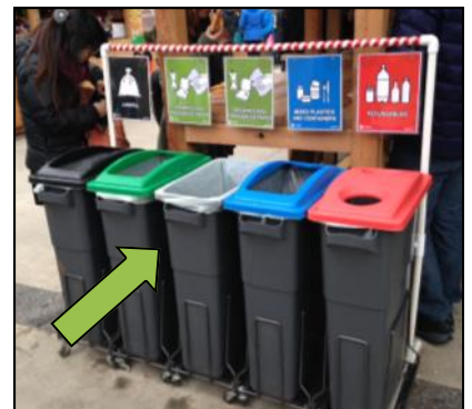
Vancouver's Winter Market Zero Waste Station included a place to put Organic waste!

Restaurants and food service operators may benefit from Metro Vancouver's publication, "Closing the Loop With Organics Recycling: A practical guide..." found on their website at www.metrovancouver.org