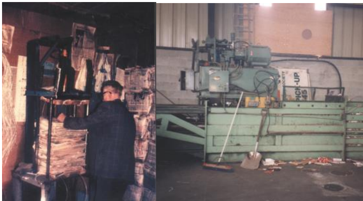
Manual RMRS Baler(1979)

In October, 2014, a brand-new baler was installed at the Maple Ridge Recycling Depot, increasing our efficiency by both the speed of the new machine (it can complete a bale in 6 minutes!) and saving the processing time we lost whenever the previous old baler broke down. We have eliminated our night shift, which was mainly catching up on baling that day's material, as everything can now be baled as it comes in.