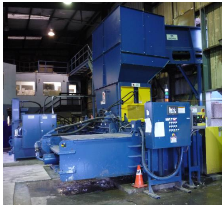
RMRS Baler with conveyor loader and chrome spoilers 2014 (just kidding about the chrome spoilers)

(Bill Elder on Building Respect...continued from previous page)