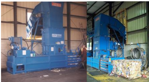
RMRS Baler with conveyor loader (2000)